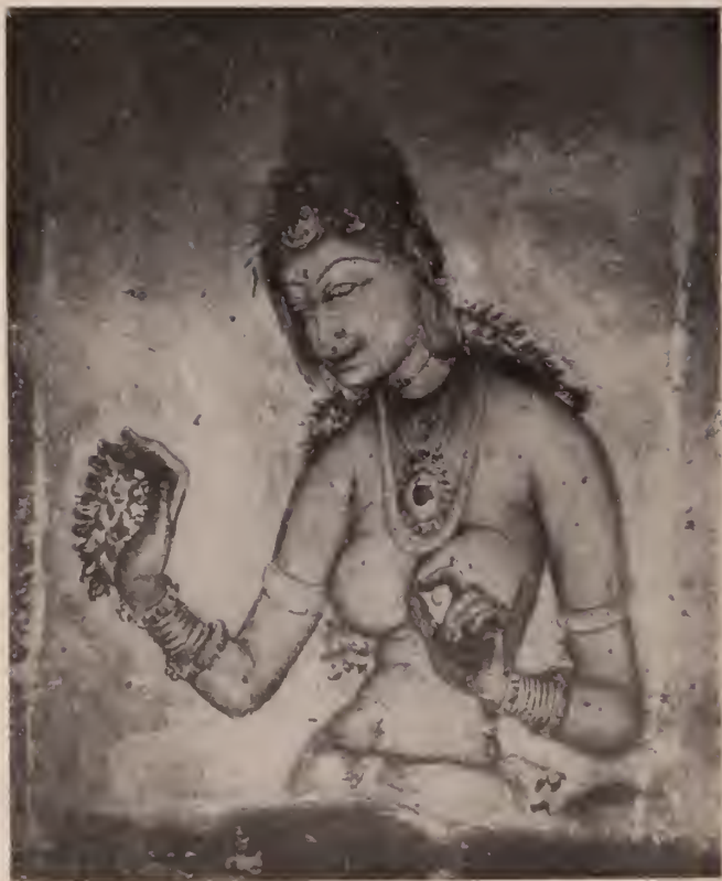
FRESCO PAINTING FROM SIGIRIYA, CEYLON (FIFTH CENTURY).